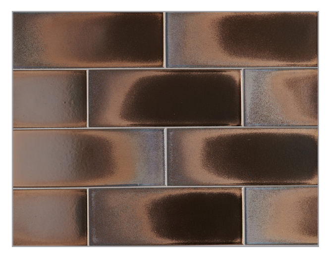
3 ½ x 9 ½