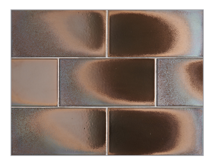
4 <sup>3</sup>⁄<sub>4</sub> x 9 <sup>1</sup>⁄<sub>2</sub>