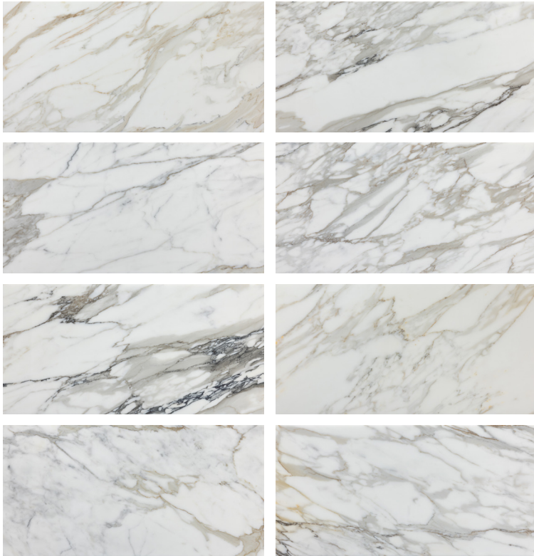
Honed & Polished