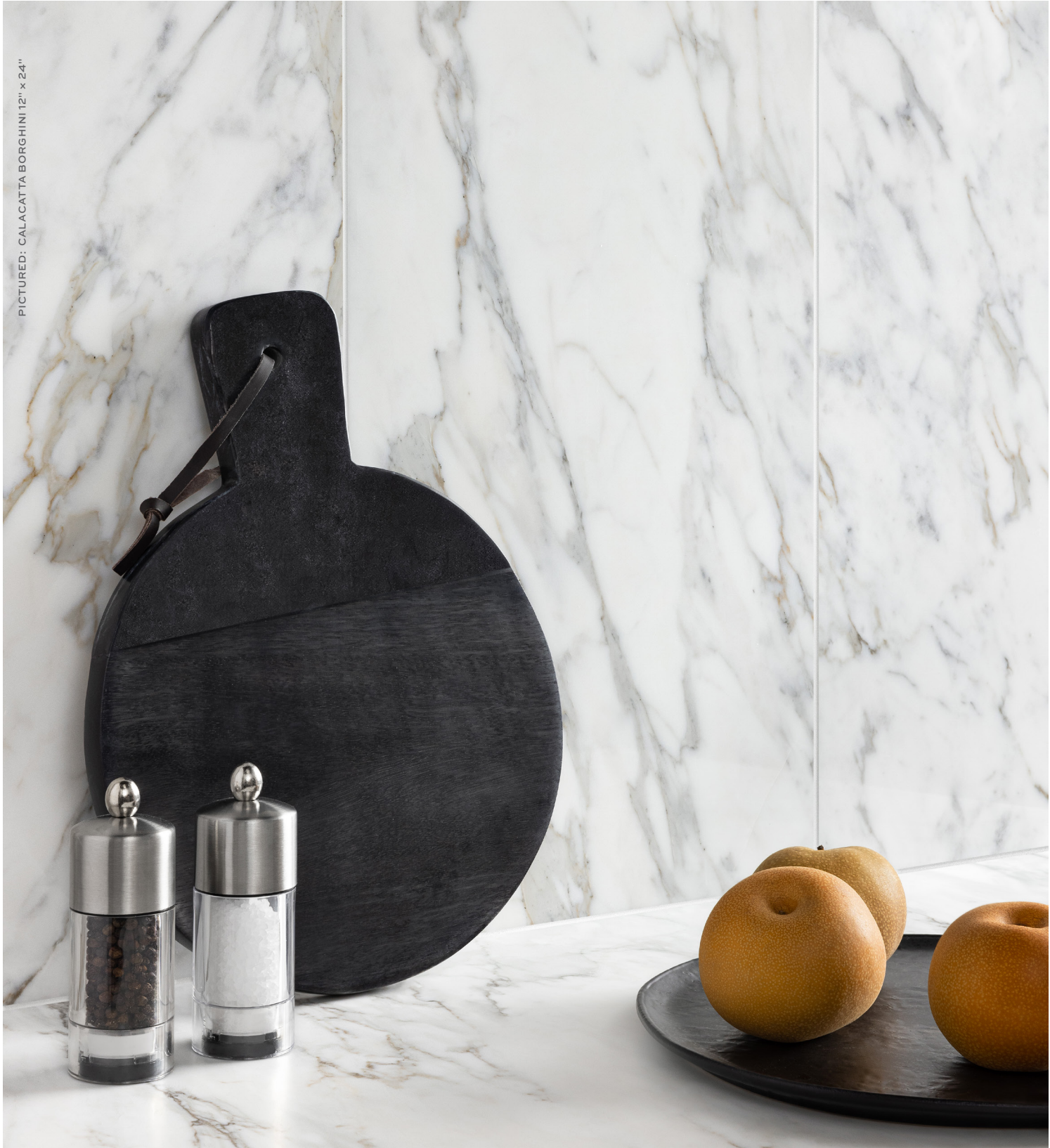
PICTURED: CALACATTA BORGHINI 12" x 24"

A marble for connoisseurs of classic stone, Calacatta Borghini is among the most exquisite of decorative materials. A highly active surface with both veins and brecciated clasts, this marble varies intensely from lot to lot and tile to tile. The colors go from pewter and deep storm-cloud greys to blends of warm taupe and ochre, all against the classic milk-white background characteristic of stone quarried in mountains of Tuscany. Offered in 12 x 24 tile, both honed and polished.