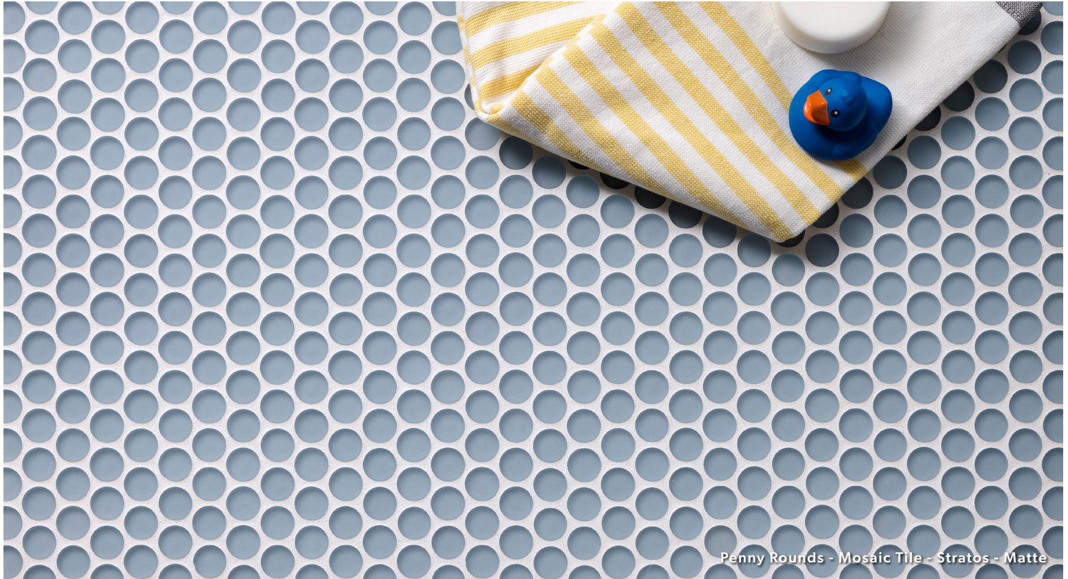
Penny Rounds - Mosaic Tile - Stratos - Matte