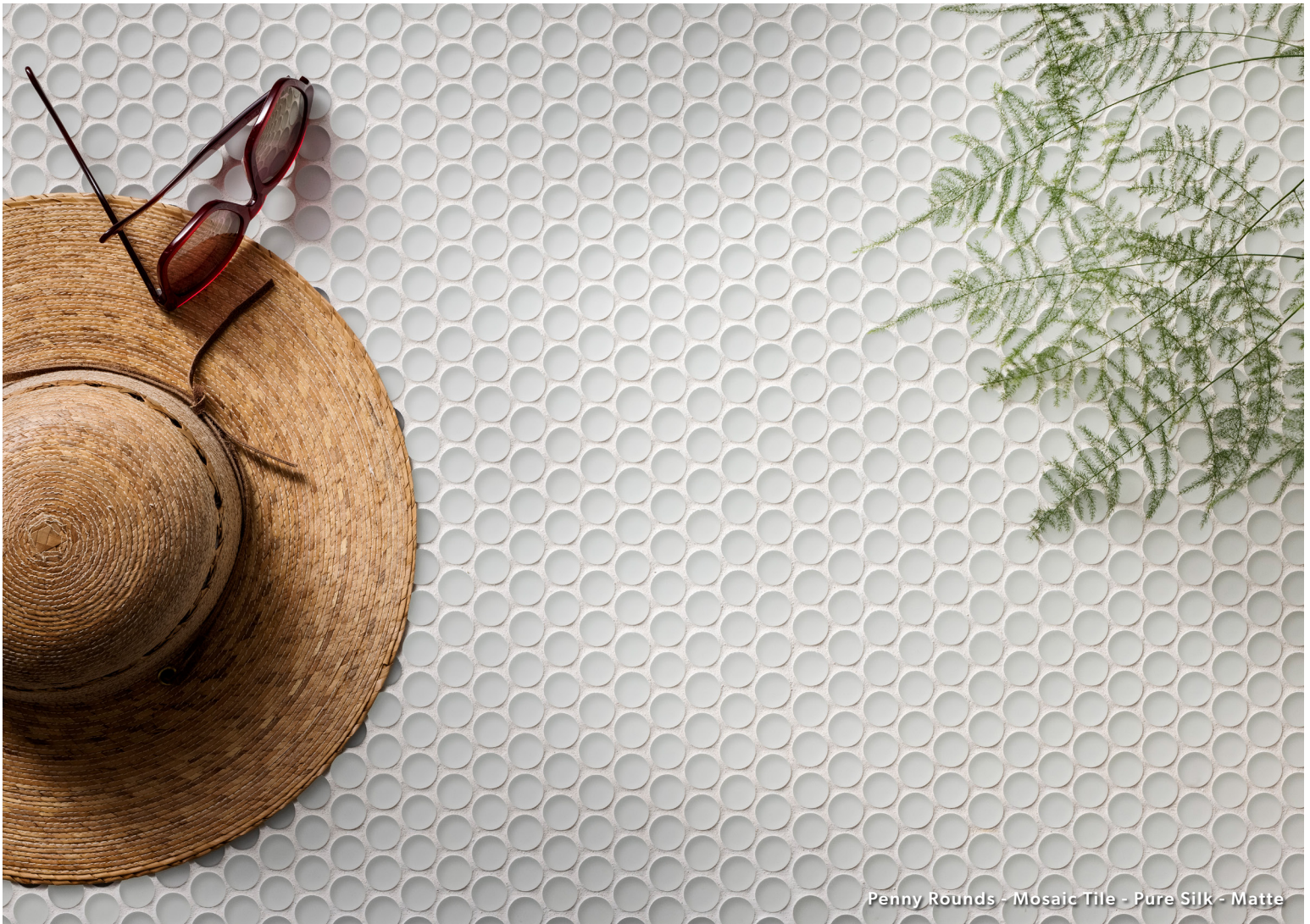
Penny Rounds - Mosaic Tile - Pure Silk - Matte