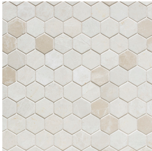
11 3/8" x 12 1/8" Hexagon Mosaic Polished