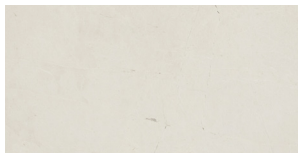
12" x 24" Field Tile Polished & Honed