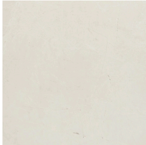
24" x 24" Field Tile Polished