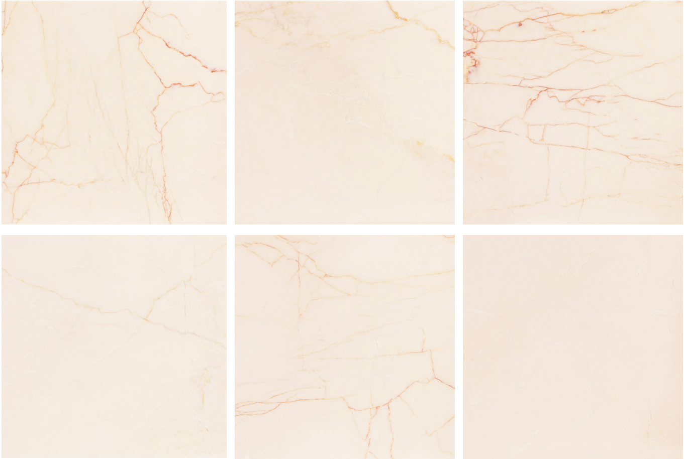
Honed 18" x 18" Field Tile