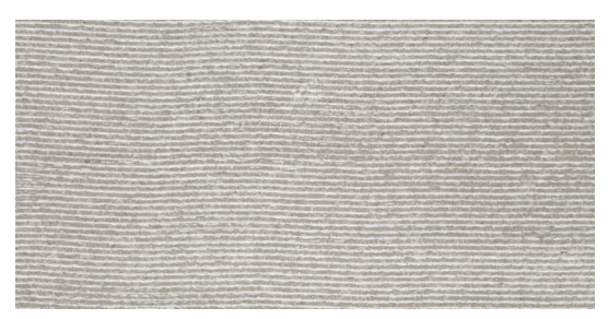
Cinder Grey Raked