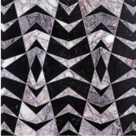
BLACK HONED Lilac, Nero