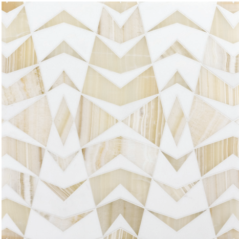
VANILLA MIXED FINISH Vanilla Onyx Polished, Thassos Honed