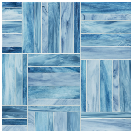
STRIPES BLUE Streetlight Blue, Trumpet Turquoise, Colonial Blue