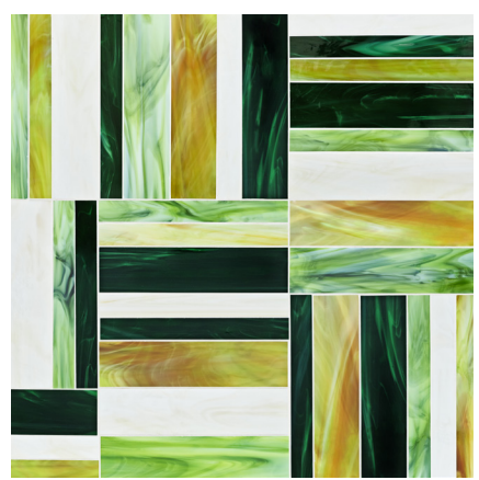
STRIPES GREEN Malachite, Dark Green, Light Green, Coltrane Cream