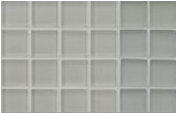
Natural | Silk Linen