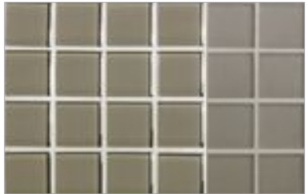
Natural | Silk Loft