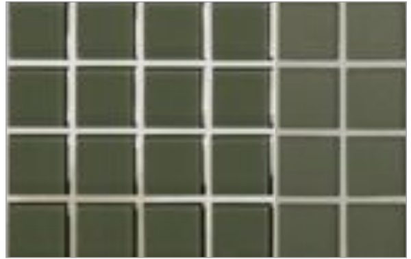
Natural | Silk Evergreen