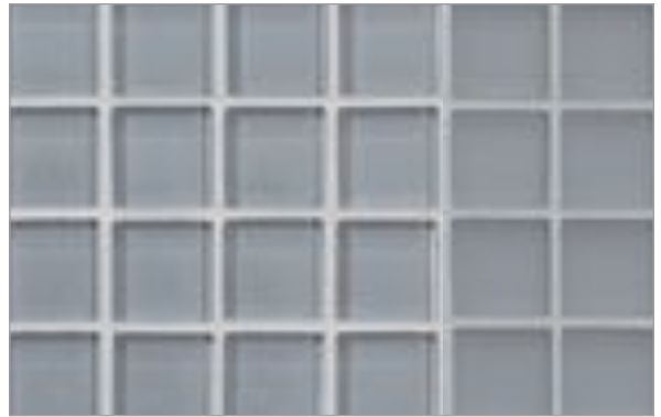
Natural | Silk Pumice