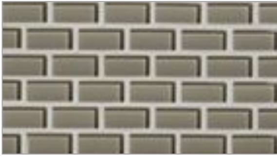
\frac{1}{2} \times 1 Mini Brick (11.5mm x 25mm)