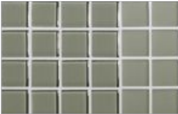
Natural | Silk Ascot Mint