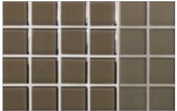
Natural | Silk Mink