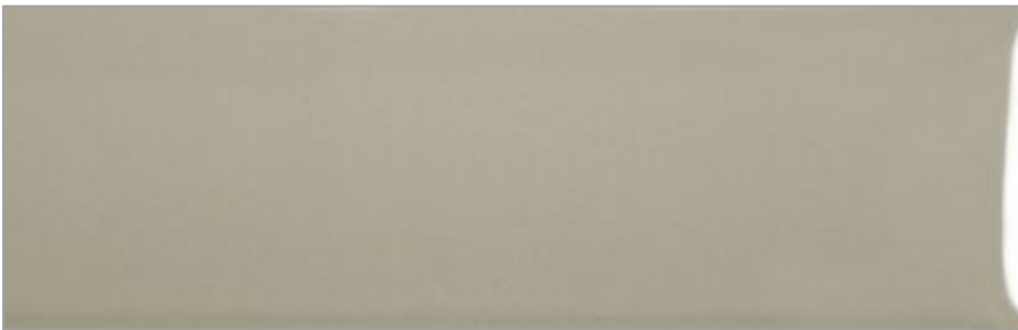
3 x 9 (75mm x 225mm)