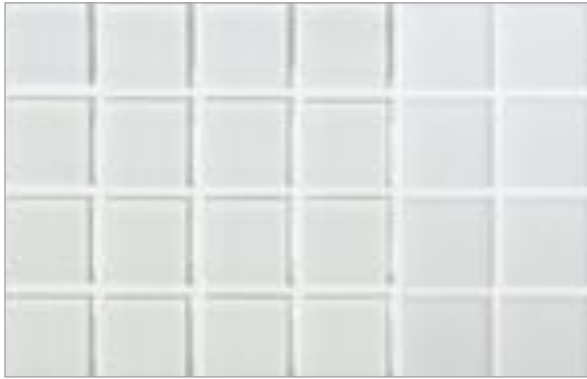
Natural | Silk Canvas