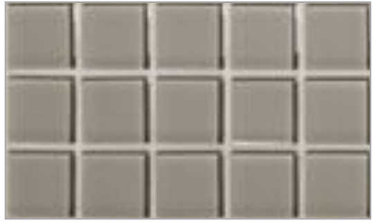
1 x 1 Mosaic (25mm x 25mm)