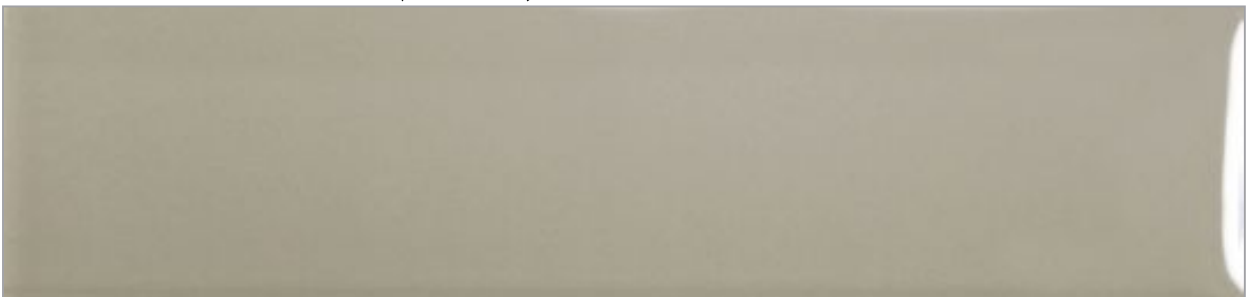
3 x 12 (75mm x 300mm)