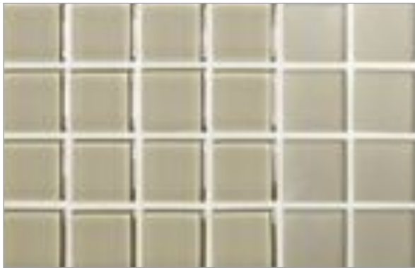
Natural | Silk Vellum