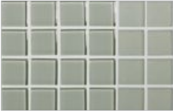
Natural | Silk Platinum Green