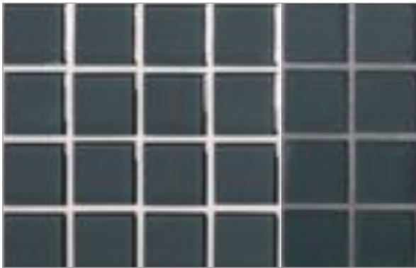
Natural | Silk Sherborne Grey