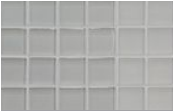
Natural | Silk Vapor