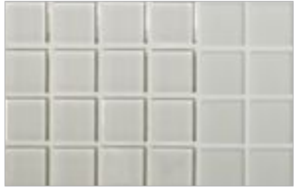
Natural | Silk Cotton