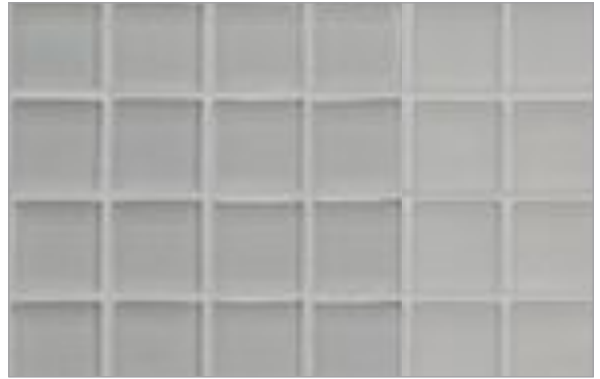
Natural | Silk Horizon