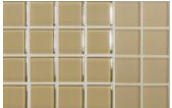
Natural | Silk Basket