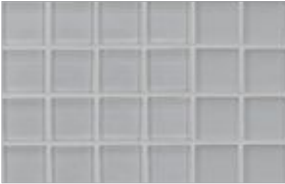
Natural | Silk Stratus