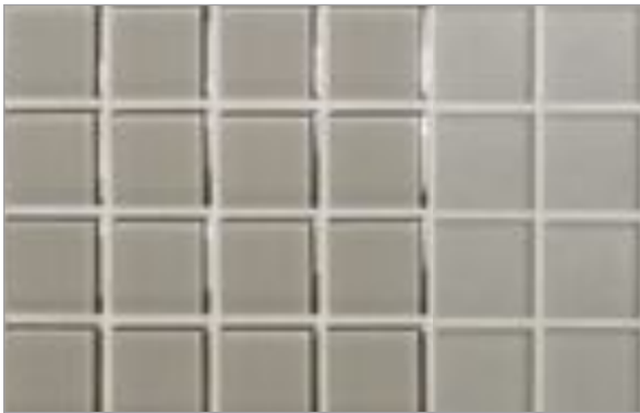
Natural | Silk Petra