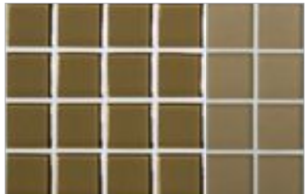
Natural | Silk Safari