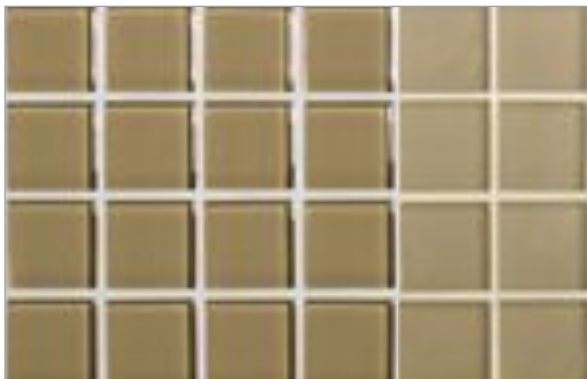
Natural | Silk Wheat