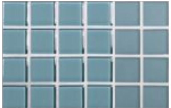
Natural | Silk Wedgewood Blue