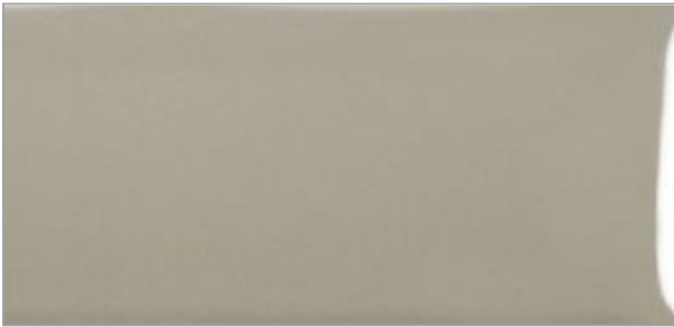
3 x 6 (75mm x 150mm)