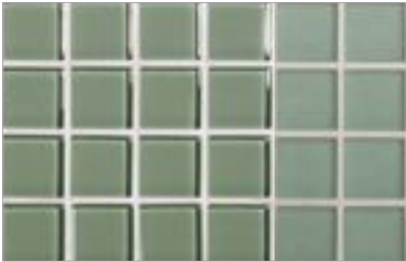
Natural | Silk Silver Green