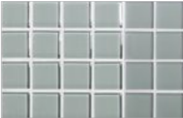
Natural | Silk Haze