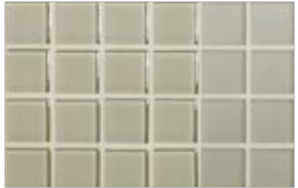
Natural | Silk Cloth