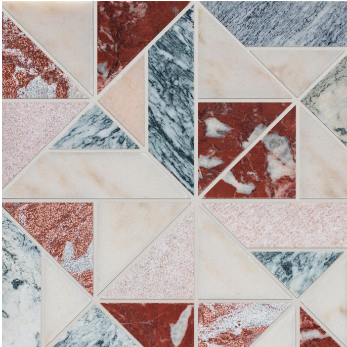
Fete - Rosso Francia, Cipollino, and Rosa Portogallo