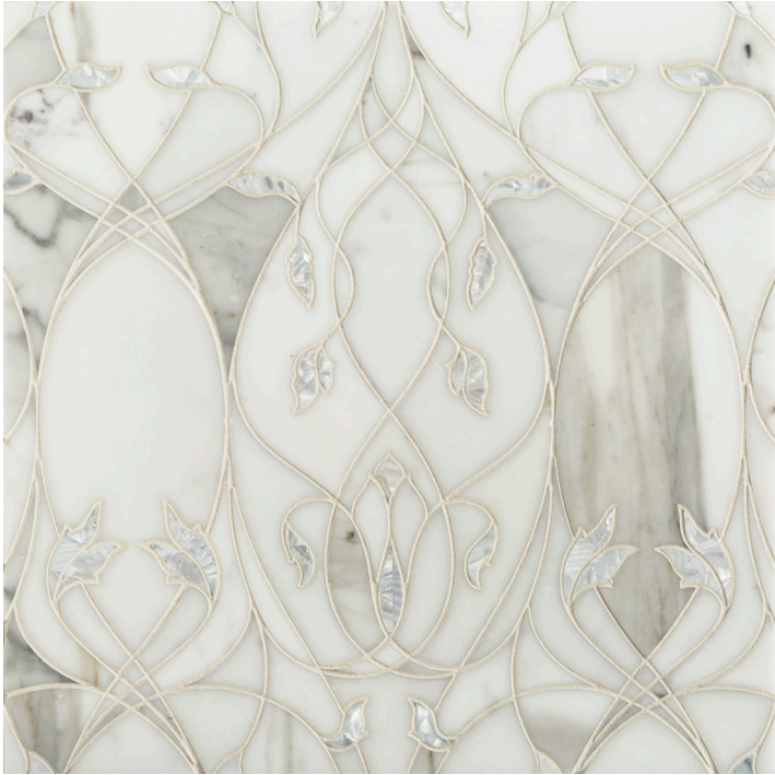
Polished Calacatta Gold & Rivershell