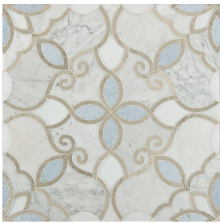
Bianco Carrara - Mixed Finish polished Bianco Carrara & Azul Cielo, honed Smoke & gloss White Glass