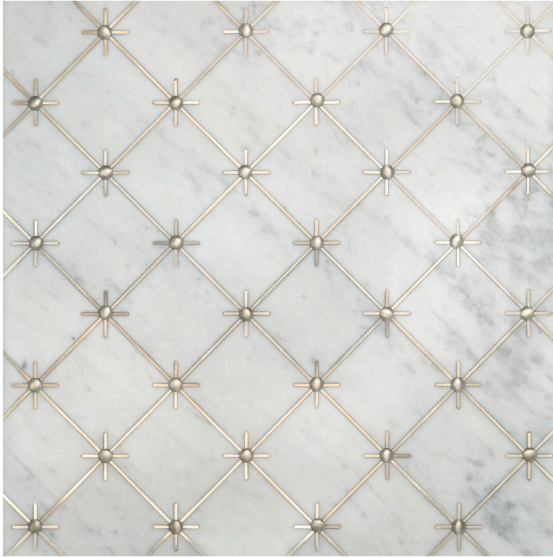
Bianco Carrara Polished Silver Metal Inlay