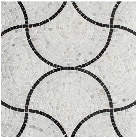
Statuary, China Black - Polished