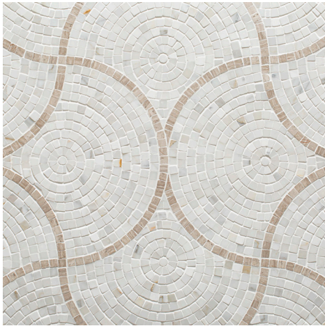
Calacatta Gold, Cloud - Mixed Finish