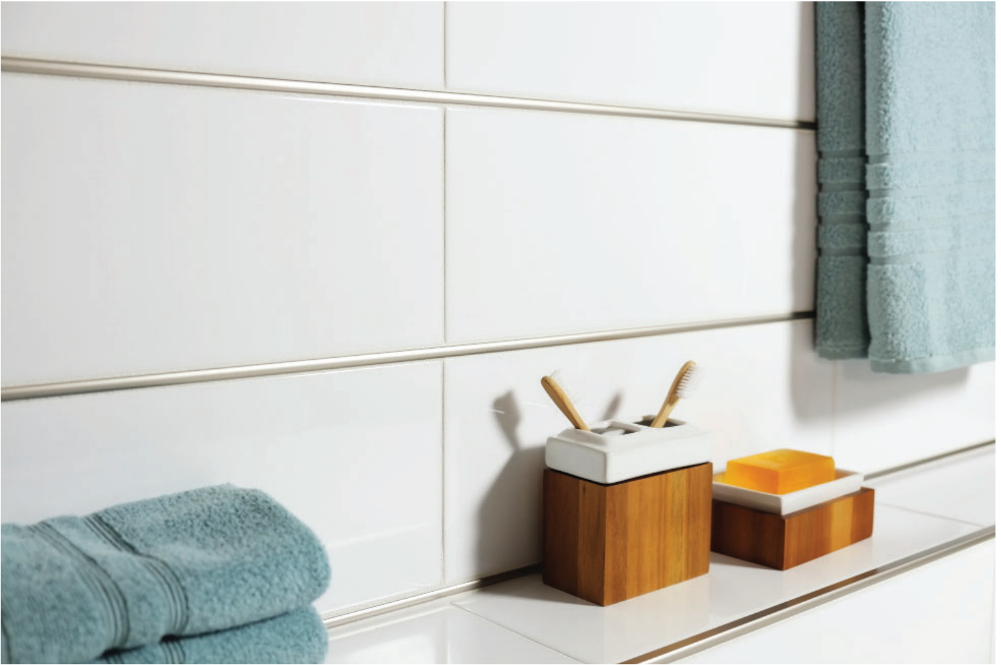
Bronzework Studio Precision Dome Liners in Satin Nickel, with white porcelain