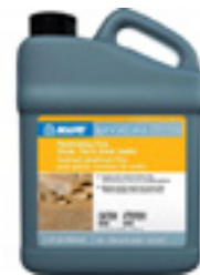
Mapei - Penetrating Plus Stone, Tile & Grout Sealer