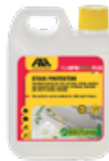
Fila MP90 Eco Plus