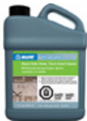
Mapei - Heavy-Duty Stone, Tile & Grout Cleaner